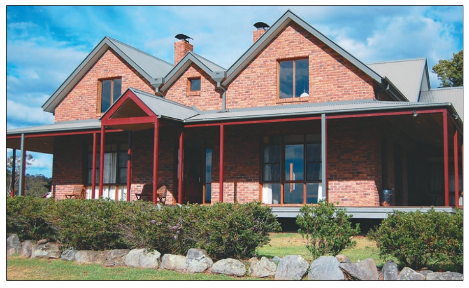
The Country House at The Knoll, above; the view from the veranda of the surrounding countryside looking across to the Great Dividing Range, top.

On a warm summer's day it would be a terrific spot too. The veranda offers views across green paddocks to the distant Great Dividing Range. Down the road 3km is Dolphin Beach and the Moruya River is a